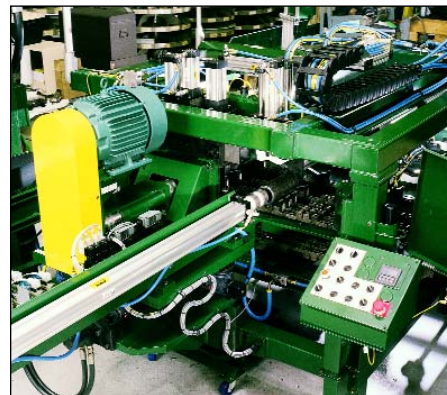
Internal swab station

Bardons & Oliver can help you solve any tubular or bar stock cut-off and end finishing problem. With over 100 years of experience, from stand-alone machines to complete systems, let us put our experience to work for you.