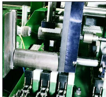
Post-process gauging station

5800 Harper Road • Solon, OH 44139 (440) 498-5800 • Fax: (440) 498-2001 E-mail: information@bardonsoliver.com www.bardonsoliver.com